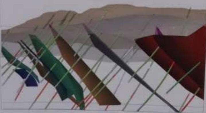
3-D ORE BODY MODELLING